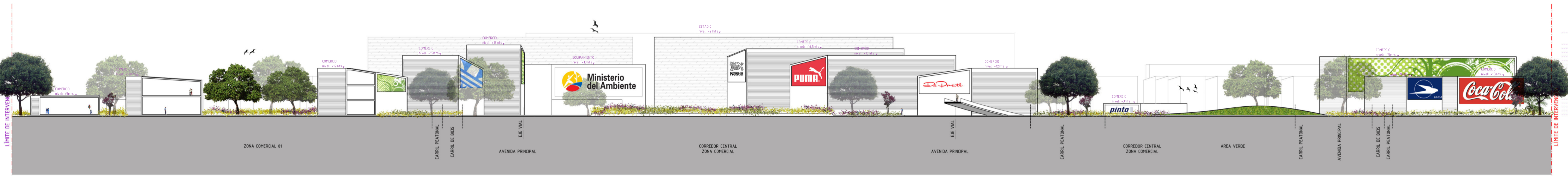
CORTE A - A`