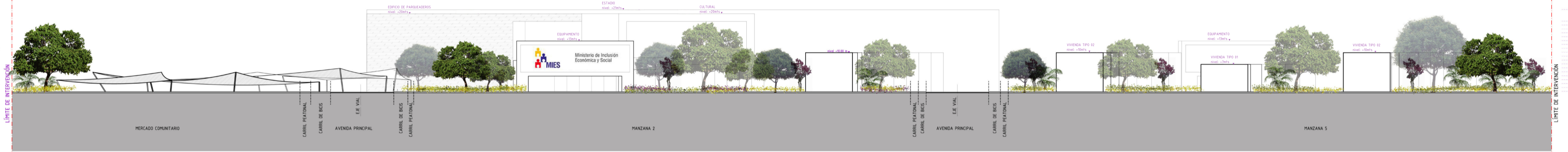
CORTE B - B`