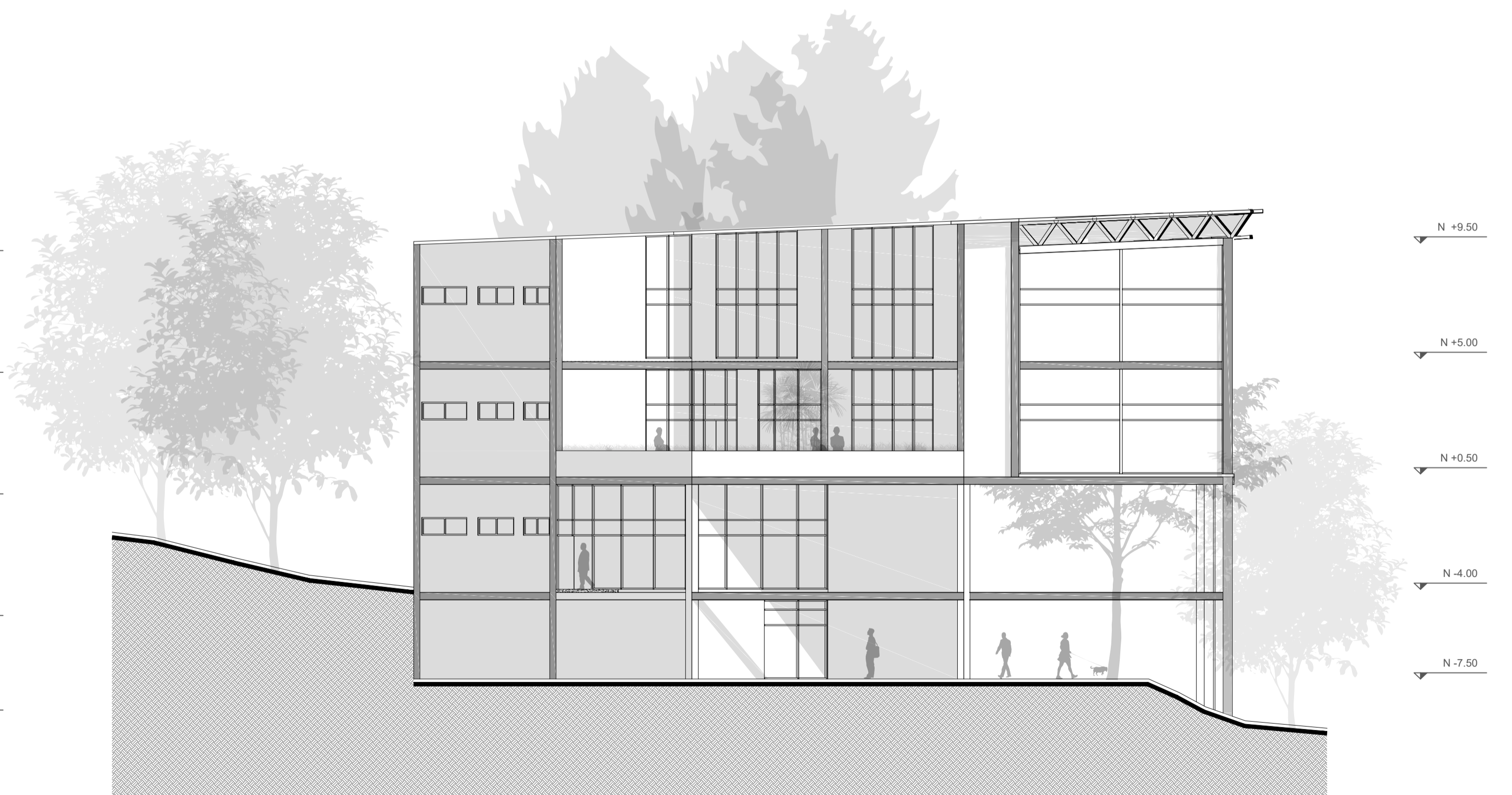
FACHADA OESTE BLOQUE B